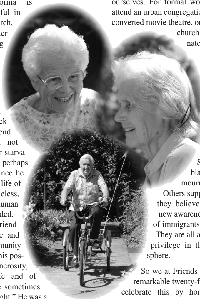
Photo collage above: Residents at Friends House enjoy living amongst friends.

So we at Friends House celebrate our remarkable twenty-fifth anniversary. We celebrate this by honoring those many hundreds, even thousands, who have contributed to our success. Many publications would list these names in a gesture of recognition and thanks. But in our simplicity, by way of honoring our founders' faith and practice, we offer thanks to the Light for our good fortune and delight.